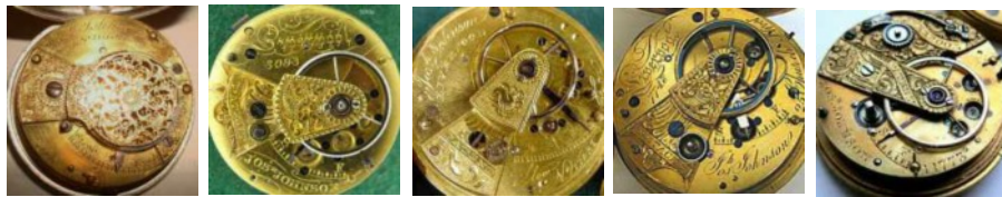
A Full-width pierced table (sometimes called 'thistle cock') B Double wedge, cutaway foot C Double wedge, full-length foot D Single wedge, cutaway foot (rare) E Parallel-sided